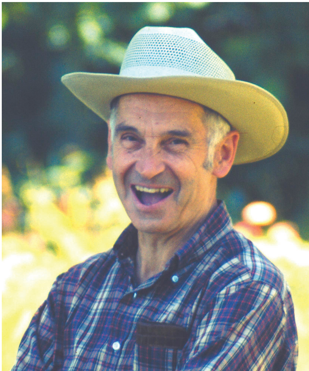
Ernst Mayr on his 67th birthday at his farm in Wilton, New Hampshire.